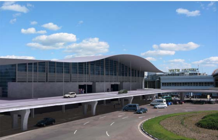
Kiev Airport. New Terminal Building. Ukraine.