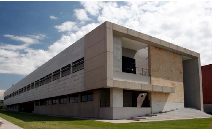
Library, Rey Juan Carlos University. Alcorcón. Madrid. Spain.