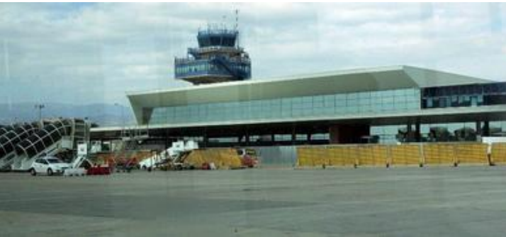
Almería Airport. New Terminal Building. Spain.