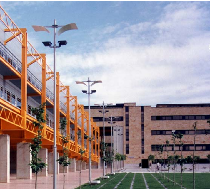
Social Science Campus. Salamanca University. Spain.