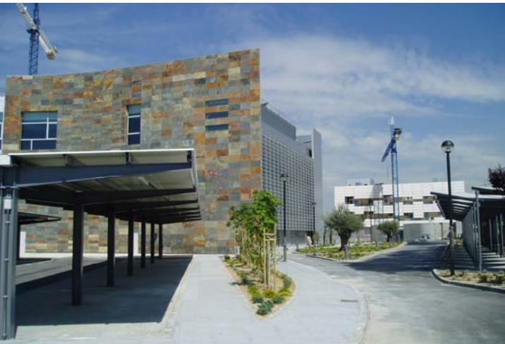
Institute for Advanced Studies of Energy. First Stage. Madrid. Spain.

Some of our clients establish sustainability criteria amongst their goals. Using the client's own methodology or outside certification agencies such as LEED (USGBC), we adopt a series of measures from the initial design process to the overseeing of the construction site.