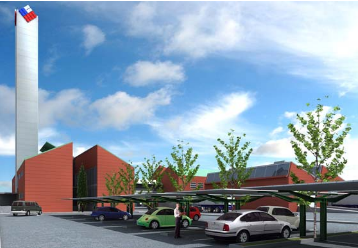
Andes Inland Port. City of los Andes. Chile.

We carefully considered the building envelope according to its function and orientation, looking for energy efficiency. We integrated renewable (solar, photovoltaic, geothermal ...) and combination energy sources (cogeneration) into the project, applying the criteria of bioclimatic architecture to make it resource efficient and minimize energy losses.