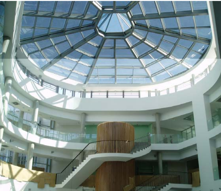
Institute for Advanced Studies of Energy. Second Stage. Madrid. Spain.