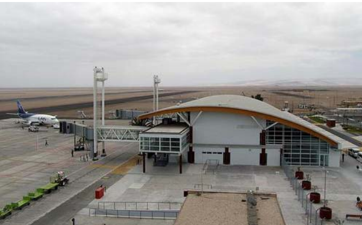
Arica Airport. Reform and Expansion of Terminal Building. Chile.